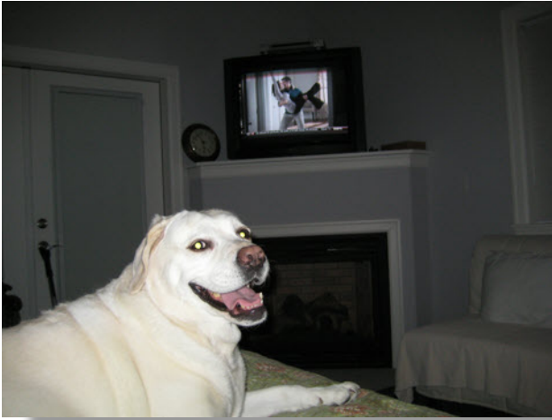
Soche watching TV from bed